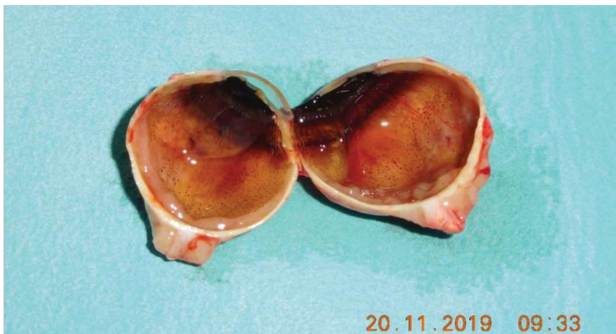
Figure 2. Bulbus after the enucleation: intrabulbar mass 2x1cm with circular overgrowing around the optic nerve

wall of the bulbus under the choroid was described as a solid infiltration of small lymphocytes, with a round or slightly folded nuclear membrane, lumpy chromatin, central nucleus, small amount of cytoplasm, with formation of germ / proliferative centres; mitotic activity was low. The same infiltration was in the retrobulbar tissue around the optic nerve.