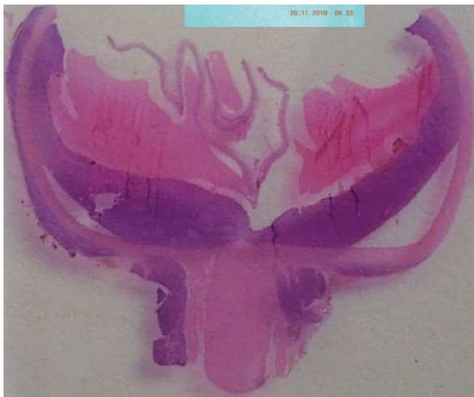
Figure 3. Histological finding: the tumour on the posterior wall of the bulbus under the choroidea and a retrobulbar infiltration around the optic nerve

enucleation, the haematologist-oncologist indicated a positron emission tomography examination with computed tomography, which was negative for lymphoma disease. Ophthalmological examinations are performed at half-yearly intervals, with simultaneous monitoring of the right eye for possible development of bilateral lymphoma. The right eye remains without signs of lymphoma. Intraocular localisation of lymphoma with retrobulbar infiltration around the optic nerve remains the only detected localisation of primary intraocular lymphoma. Enucleation was used as a diagnostic as well as a treatment modality.