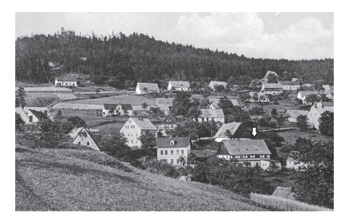
Figure 2. Birthplace of Ferdinand von Arlt in Obergraupen (Horní Krupka), early 20th century (arrow)

by Prince Johann von Clary und Aldringen (1753–1826) [1]. The school was in the centre of the village next to St. Valentine's Church. Today, on that site at the address Vrchoslavská 2/3, is a three-story residential building. He attended grammar school from 1825 in Leitmeritz (today Litoměřice) in Jesuitengasse, which was located next to the Episcopal Priestly Seminary (former Jesuit residence). In Litoměřice he had accommodation at the grammar school (alumnat) [2]. Today this is Jesuit Street no. 18 and 20, and the former seminary was at no. 22.