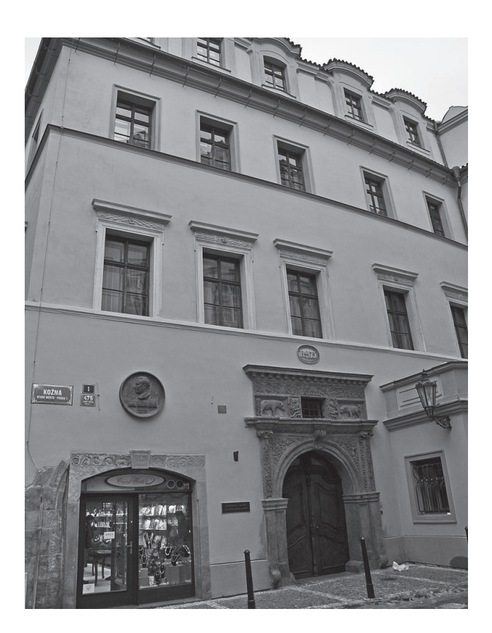
Figure 5. Schwefel Gasse no. 475, today Melantrichova Street no. 16

From 1844 to 1847, he lived in the centre of Prague (near the Old Town Square), at Schwefelgasse no. 475/I. Since 1894, it has been called Melantrichova Street (no. 16). Above the entrance are sculptures of two golden bears. That is why the house is called "House at the Two Golden Bears" (Dům u Dvou Zlatých Medvědů). It is a large Renaissance building, one of the oldest buildings in Prague, built in 1559–1567 on the site of two Gothic houses. The building was reconstructed in 1975–1980 [21–23] (Figure 5). In 1846, his teacher J. N. Fischer lived in Prague's New Town at Heinrichsgasse no. 889 on the ground floor (today Jindřišská 17) [24].