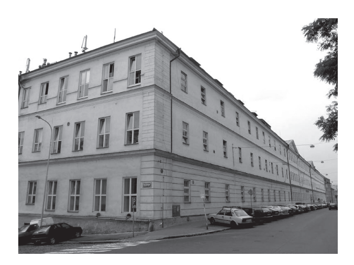
Figure 3. Eye Clinic was located on the second floor in the east wing of the general hospital in Prague (today U Nemocnice 2)

Von Arlt was the first to give an accurate description of trachoma (1855) and was the first to understand the essence of the pathogenesis of myopia (1854), arguing