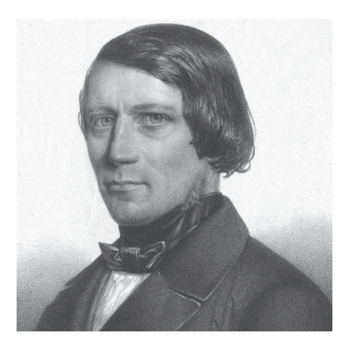
Figure 1. Ferdinand von Arlt (1812–1887) at the age of about 40 (Lithograph by Moritz Golde, printed in the studio of Franz Hanfstaengl in Dresden)