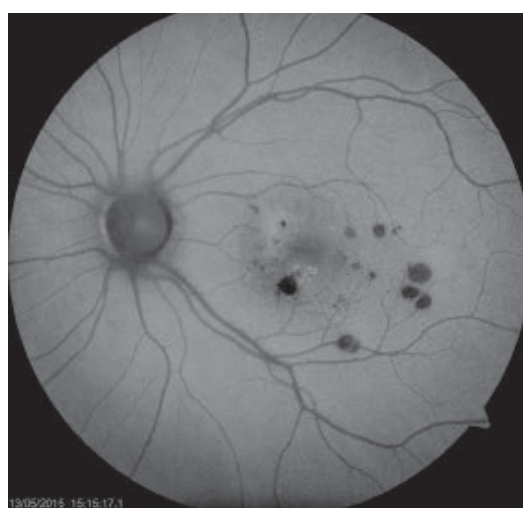
Fig. 6 Auto-fluorescence photograph of ocular fundus of left eye. Deposit of atrophy of RPE