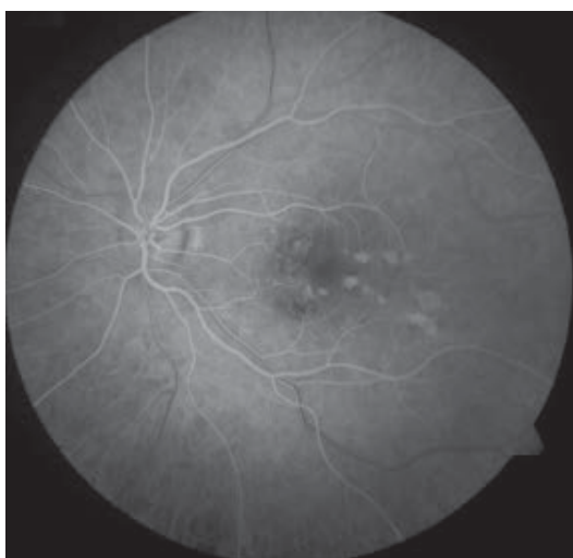
Fig. 3 FAG of left eye. Hyperfluorescence of window defects of RPE in place of inactive inflammatory lesion