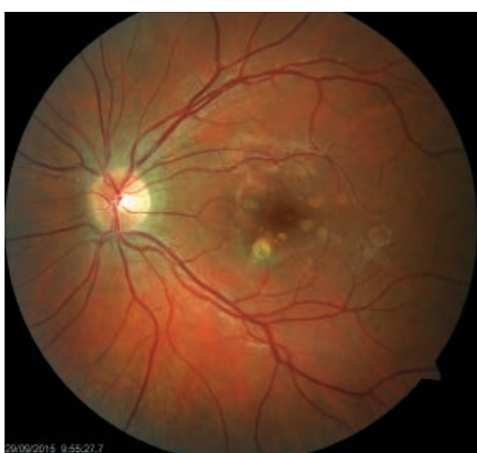
Fig. 5 Left eye. Original active deposit on retina progressively bordering and partially pigmented